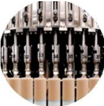
Filling Machine Line