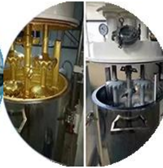
Batching Production Line