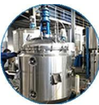
Creaming Machine Line