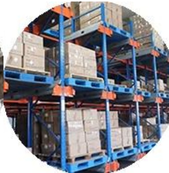
Real Material Stock