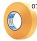
07 Masking Tape