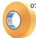
07 Masking Tape