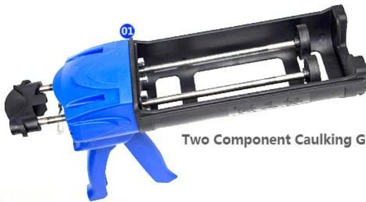
Two Component Caulking Gun