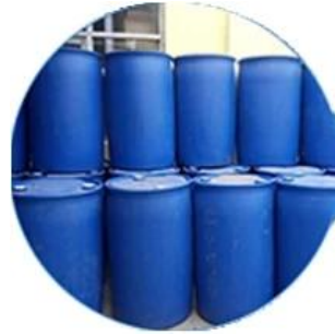
Real Material Stock