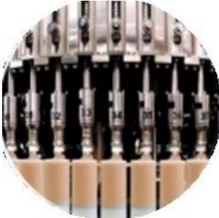
Filling Machine Line