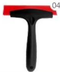
04 Rainbow Scraper