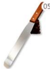
05 Stirring Knife