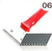
06 Perching Knife