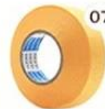
07 Masking Tape