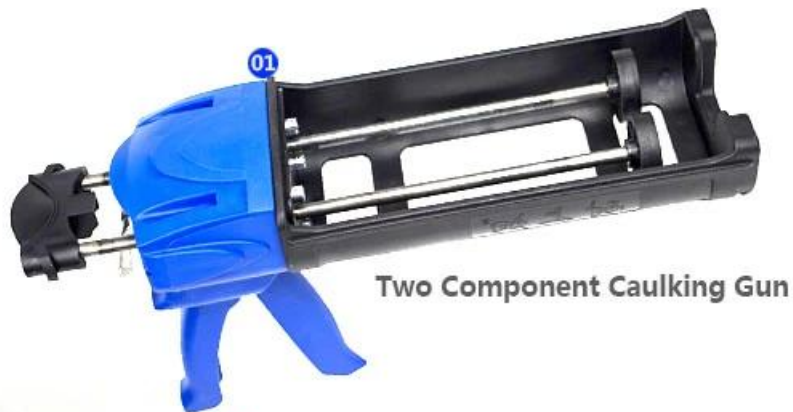
Two Component Caulking Gun